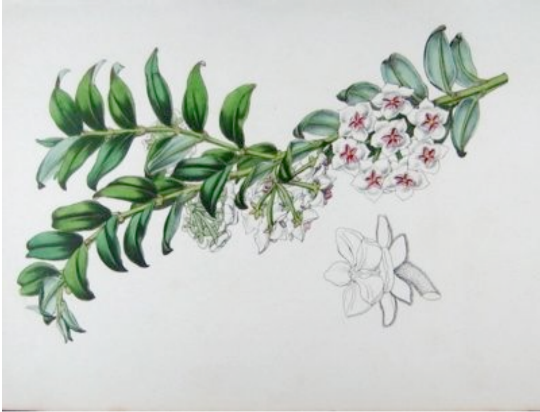
figure 6: the original illustration of H. bella , Tab 4402, published along with the type description in Curtis' Botanical Magazine in 1849.

(tab 4402) which is widely used as H. bella 's type sheet.