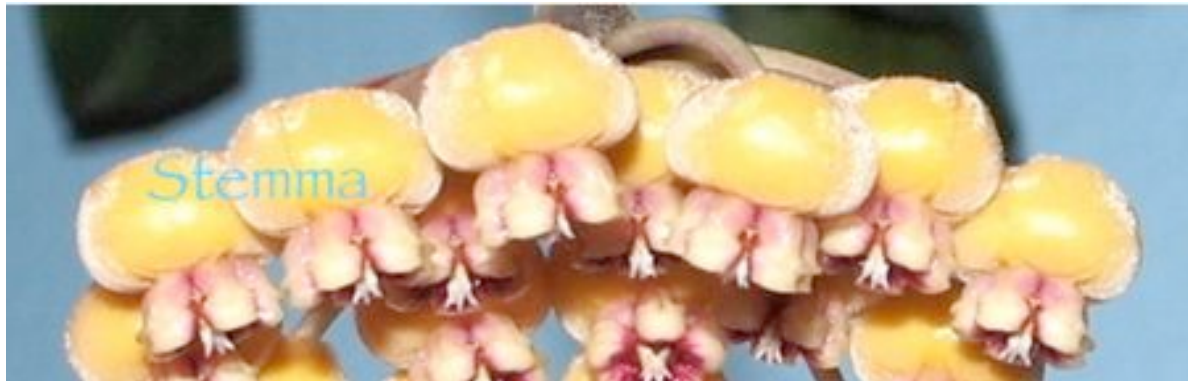
figure 3: side view of fully opened flowers. The corona segments here look very much like horses teeth.

In its native habitat in Borneo, it has been collected in rather densely shaded forests, growing in the loose leaf litter of the forest floor and climbing up into low growing bushes, which it accomplishes by means of adventitious* roots from along its stem rather than by twining. It has been speculated that the very long peduncles* are an adaption to display the flowers above the leaf debris in its native home, and at least one plant has been found creeping along in the leaf litter with its peduncles growing straight up into brighter light. Other reports state that H. waymaniae usually begins flowering after having climbed into low branches of nearby shrubs, onto rotting logs, or across stone outcrops and hence into brighter light. Torril Nyhuus reports that on her 1997 collecting trip to Borneo she found it growing from sea-level to 500M.