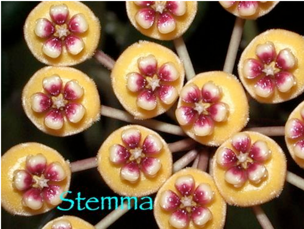
figure 4: close-up of fully opened flowers.

H. waymaniae prefers warmer temperatures-generally over 60' F (15' C) - and benefits, as do most Hoyas, from good air movement. A well draining, fairly loose mix suits this plant. Given its shallow root system an azalea or "squat" pot would seem to be in order. There have been many, sometimes contrary, claims about the appropriate watering regimen for this species. It seems to respond well to drying very slightly between waterings, much like H. carnosae , but certainly resents drying out completely, as the leaves will desiccate quickly in response to water stress. High humidity, such as is found in its native forest home, also seems to be an important factor for growing this species. Specimens grown in low humidity seem to be more prone to sunburn and desiccation.