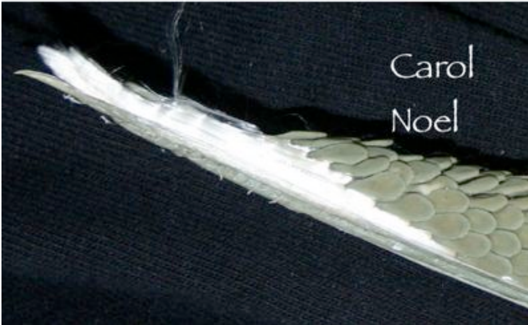
figure 9: Close-up of seed sheath, with brown seeds connected to compressed white floss.

Rolling back the stocking, the seeds exploded in silent energy...like a quiet volcano...it was so magical and there was no way I could capture this energy except to coax the seeds onto a tray of medium, and to dampen them with warm water and wait. I didn't have to wait long to wait-2 days later they popped- and they are still growing. In a few weeks I will select the 30 strongest of the lot to grow out even further. Then, later, cull them down to perhaps 20. I suspect they are self-pollinated, although Hoya 'Ruthie' grows on the tree just next door.