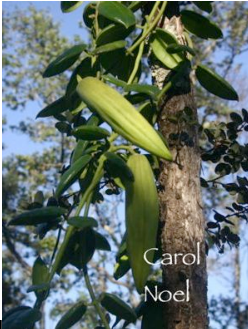
figure 7: unopened seed pods on H. ciliata .

Well, there I was - walking along the road where I had planted a bunch of Eriostemmas * to grow up trees (fly...be free. I am fortunate to live in an area where Eriostemmas flourish...and can almost be considered weeds). I am usually looking down (weeds to pull, what bromeliads are blooming, what plants needs dividing, signs of bug damage?) or