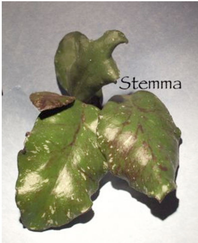
figure 2: leaves of H. waymaniae