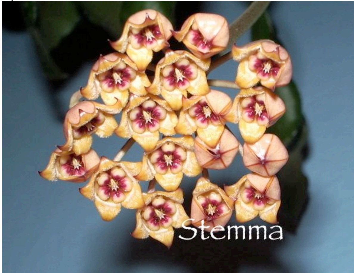
figure 1: The partially opened flowers of H. waymaniae . 3