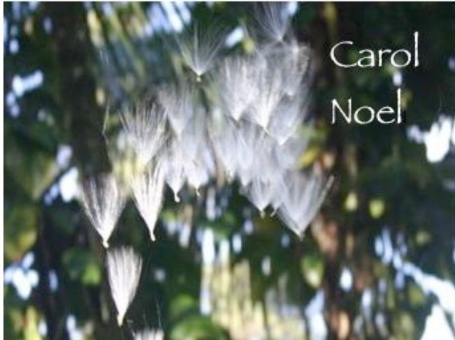
figure 10: floating seeds attached to expanded floss.